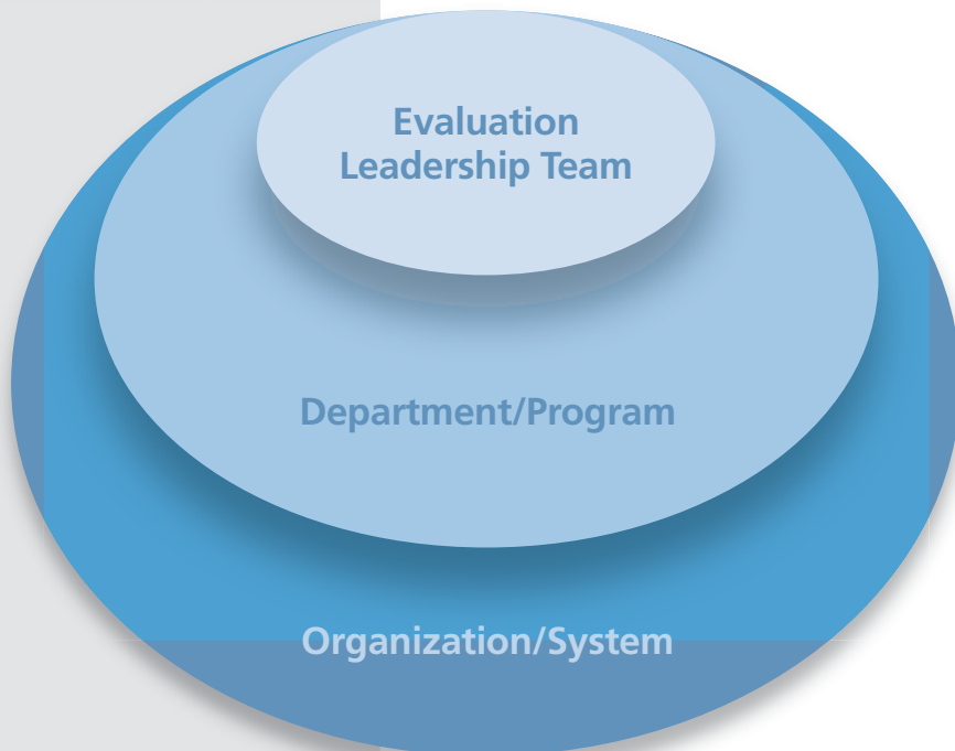
Figure 2: “Layers” of a Community of Learners